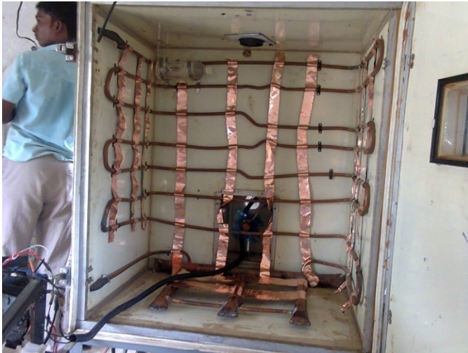
Fig.7 : Inside

ii) Maintaining Temperature :- Copper tube is circulated inside the chamber. Temperature of water from solar water heater is between 65° C-70° C. Flow of liquid is controlled to maintain 37.5°C temperature inside the chamber. Copper tubes are conveniently fitted into the chamber. To distribute the heat evenly in the chamber, copper roll (Fab inventory) is used (Fig.5)