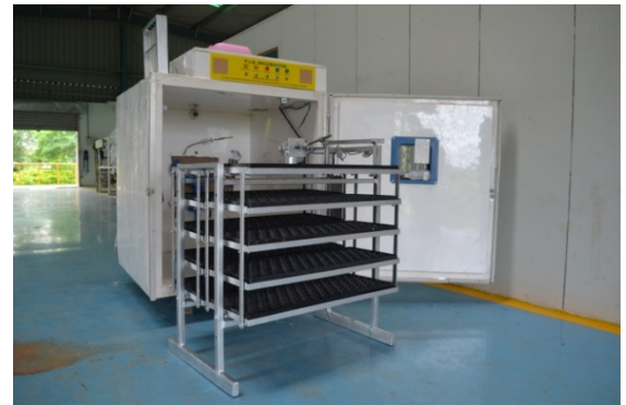
Fig.9 : Rotating tray unit

iv) Rotation of Tray : It is realized that conventional hatcheries have a fixed tray and it is difficult to clean them from inside. Therefore tray assembly is designed as an independent unit. Further hatcheries in the market uses stepper DC motor for tray rotation. It costs around INR 15000/-. It was replaced with motor used in automobiles to operate glass windows. Later on it is replaced with wiper motor in the automobile. Wiper motor with timing motor and limit switches. This together reduced the cost of mechanism by 75%.