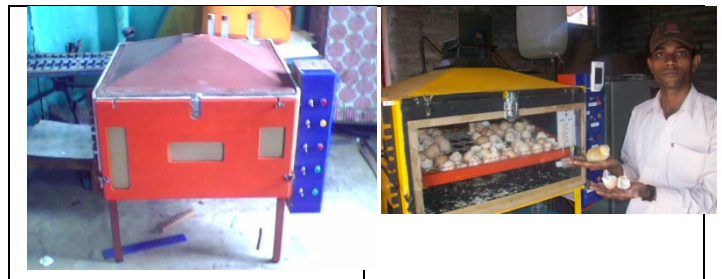
Fig. 3 & 4 : Incubator chamber in tin sheet