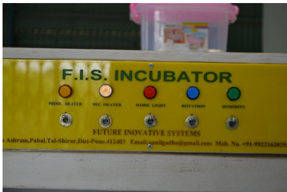
Fig.10 : Name plate cut on laser cutter

vi) Testing incubator : Present egg incubator is in its fifth version. It went through many trials. In order to test the system and to record temperature, humidity and rotation of trays, students kept round the clock monitoring of the system. In the initial trails, there were some failures. Especially rotation of tray and failure of temperature control system. Results of the trials are given below :-