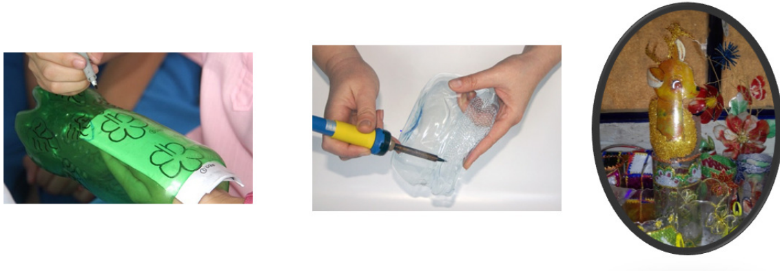
Figure 2. Manual Process Manufacturing Lanterns

the candles, lanterns are made, and many people take advantage of these as an entrepreneurship option. This was the case of community mothers, who were developing lanterns manually, using recycled bottles as an input. As shown in Figure 2, the manual process consisted of manually tracing the previously printed images, and then using a soldering iron to cut the designs, which were then hand painted. The manufacturing process, not including the decoration, on average, was 4 hours per lantern, and the total production of the group was about 80 lanterns. With this manual process of manufacture, community mothers exposed themselves to burn their hands, and being so manual, the repetitiveness of the lanterns was very low.