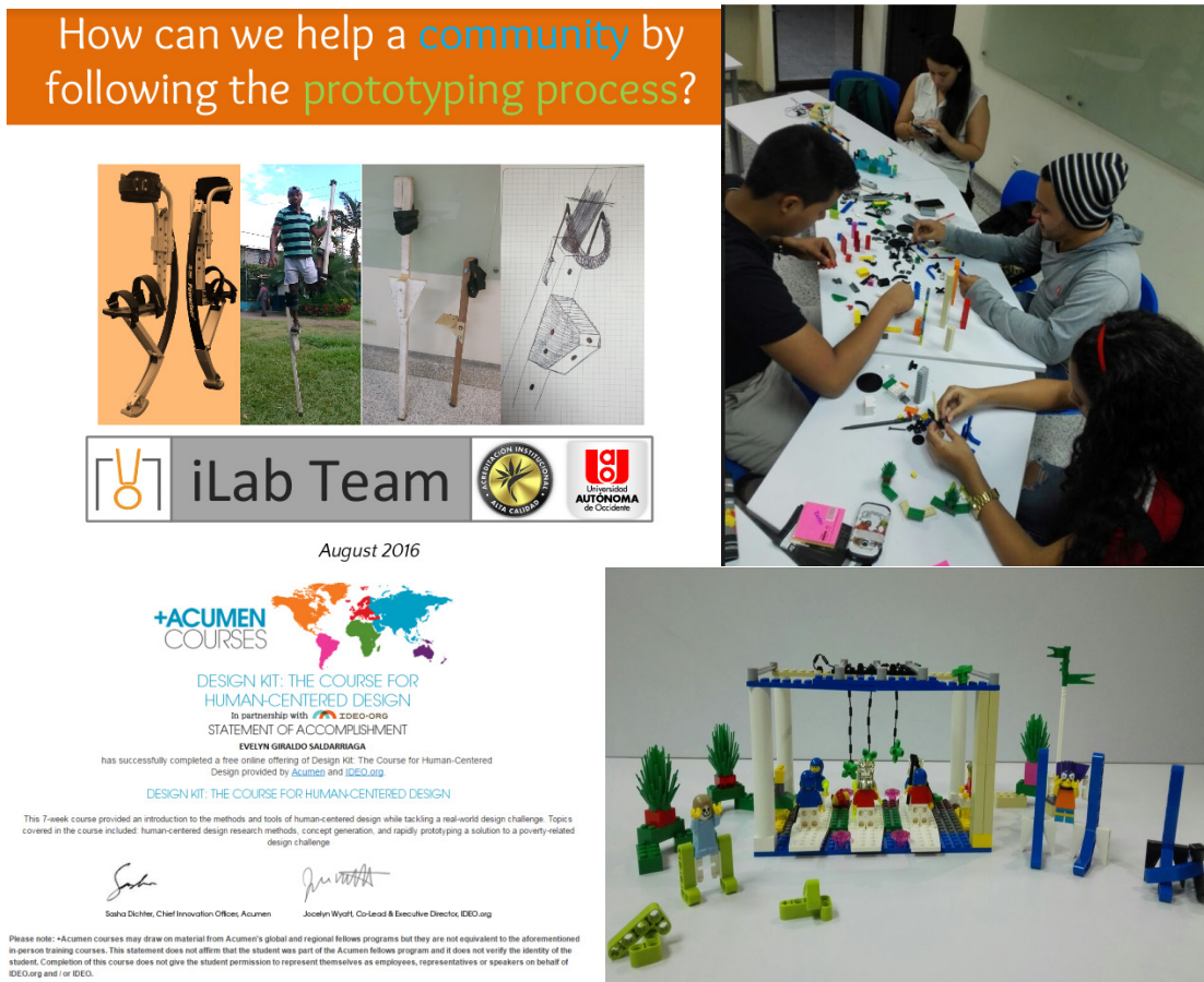
Figure 1. User-Centered Design Course and Prototyping

As the first activity of the laboratory of innovation, the student group of the lab participated in the IDEO virtual courses of user-centered design and prototyping. In these courses the techniques of Design Thinking for social transformation were applied and the work done with a community of mothers of a neighborhood in Cali, Colombia, and a group of users of the foundation of the Universidad Autonoma de Occidente, who have a group of stilts made by hand were used as experience. With the community of mothers, a concept of an art coffee was conceived, where artists, designers and communitarian mothers merge with a café that allows the display of co-created products. Figure 1 show the results of these processes, where students were certified in both courses.