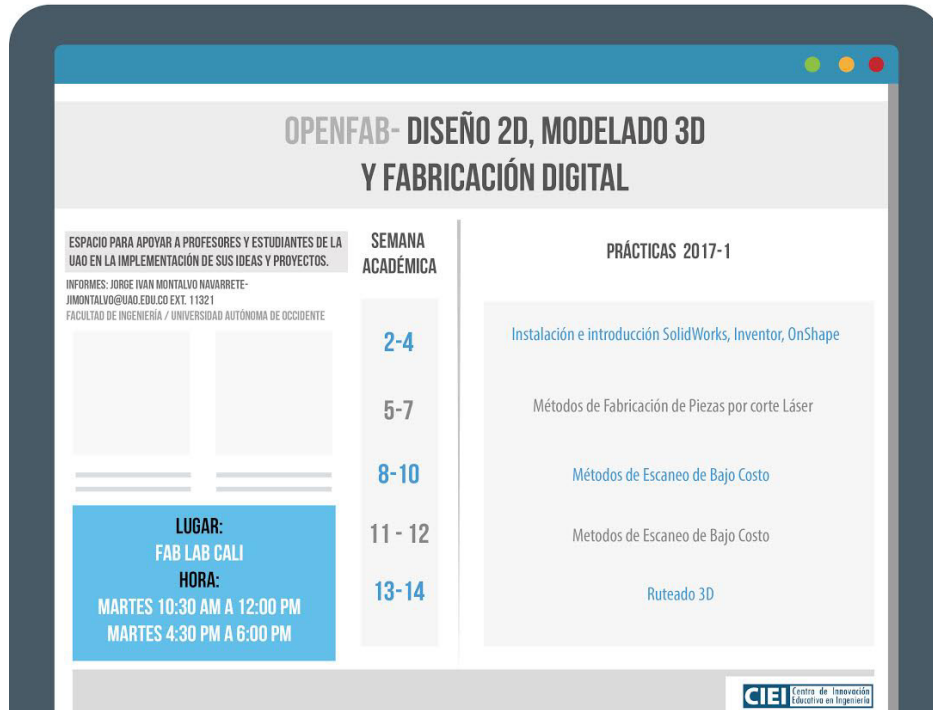
Figure 5. OpenFab Advertising 2017

space, and in addition the development of use guides and examples that later serve as tutorials to share to those who could not attend. Currently, these generated reference guides are a collaborative document that is improving after each iteration for a better understanding, and are available to all to learn about digital manufacturing. Figure 5 shows the advertising of space for the entire community of Cali.