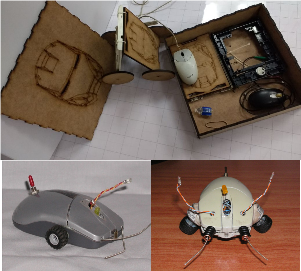
Figure 4. Robotic Kits for Children from Recycled Elements

This is a clear example of how, through innovation and digital manufacturing, a group of university students can create a learning experience for school children, developing their skills of autonomy, creativity, social responsibility and relevance, motivation and the introduction in scientific subjects for children who learn about circuits and robotics using recycled materials.